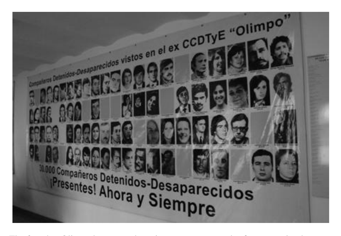
The fact that Olimpo became a detention center as a result of a transaction between

Olimpo was one of the central clandestine detention centers in Buenos Aires during the junta regime which in year 2005 was transformed into a site of memory/community center. Prior to the junta it was used as a train station owned and run by a private company. In 1976 it was handed to the police and was turned into a police station. There are still no official documents found for this transaction. Olimpo functioned as a clandestine center in the period between August 1978 and January 1979. It is estimated that 500 people were kept in Olimpo with only 90 of them surviving. Detainees were from all levels of society with different political affiliations.