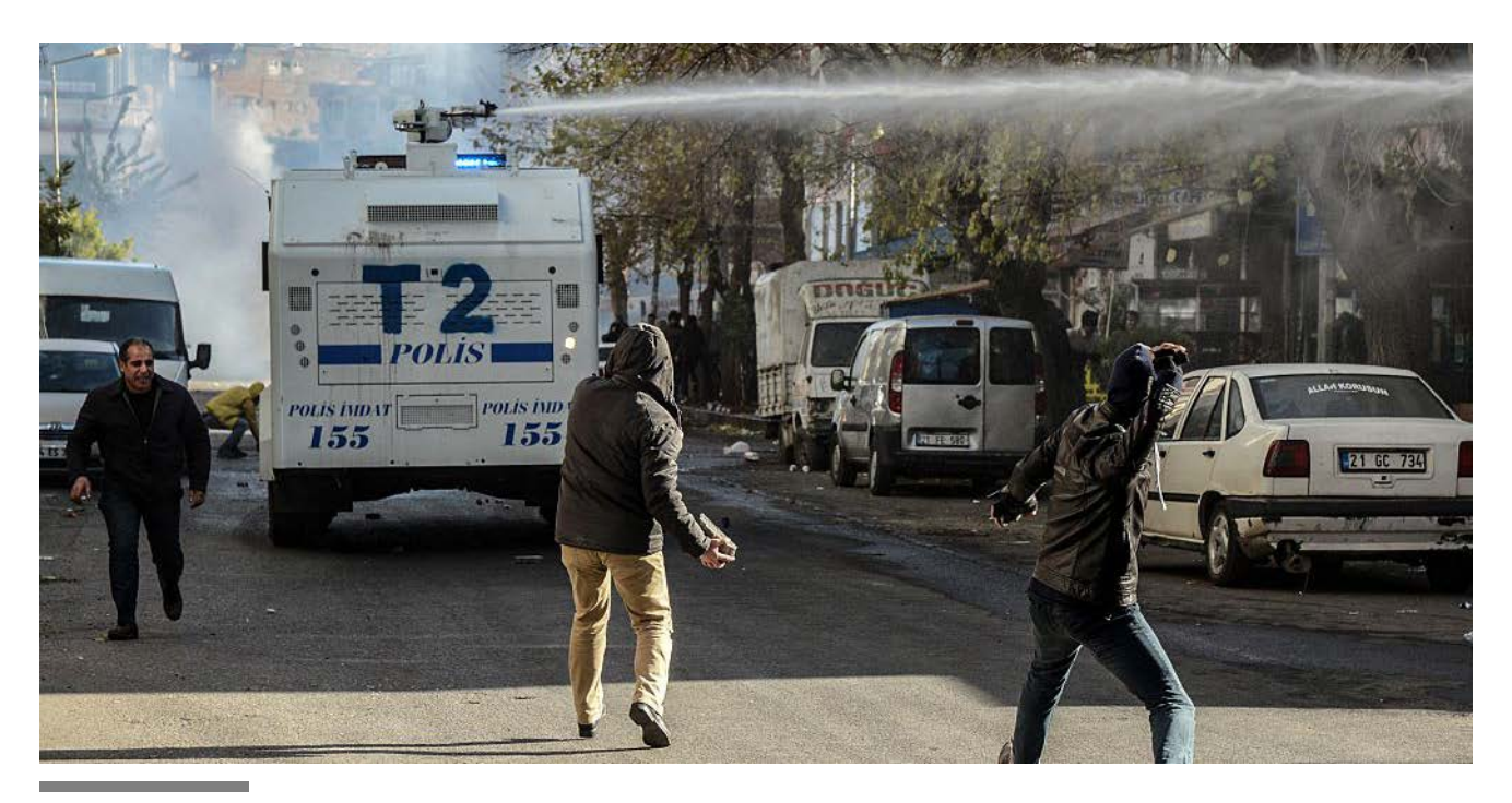
Protesters throw rocks as police use a water cannon during a demonstration in Diyarbakır on December 22, 2015 to denounce security operations against Kurdish fighters in southeastern Turkey.

However, renewed tension was already brewing. In 2014, the main Kurdish military force in Syria, the People's Defense Units (YPG),9 made advances against the self-declared Islamic State (IS), also called ISIS or ISIL, which had occupied Kurdish majority areas in Syria. Iraqi and Turkish Kurds, eager to support Syrian Kurds in their battles against the IS, were stymied as Erdoğan refused to open the borders to allow fighters and convoys to cross. Erdoğan, according to media coverage, appears to view the Kurdish YPG as a threat to Turkey equal to the IS.10 The Kurds in Turkey, enraged by what they perceived as Turkish support of the Islamic State against the Syrian Kurds, erupted in protests across the southeast, resulting in deaths and injuries as demonstrators clashed with security forces.11 Soon afterwards, Erdoğan reversed his position on the peace talks, instead vowing to eliminate the PKK. 12