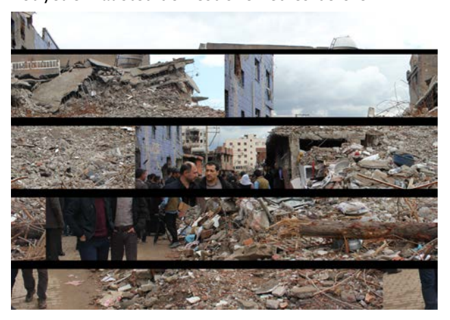
Men look at a collapsed building over the site of one of the Cizre basements, where 130 to 190 people died. The sites were later razed, reportedly on the orders of Turkish security forces.

Access to emergency medical care in the southeast has been the focus of several petitions to the ECHR. In a decision issued on February 2, 2016, the Court underscored the requirement that the curfews end and that Turkish authorities take all necessary steps within their powers to protect the right to life and physical integrity of those seeking immediate access to medical assistance. On January 26, however, the Court had rejected the petitions from 14 people in Cizre who were requesting immediate medical assistance on the grounds that the applicants had not yet exhausted domestic remedies before