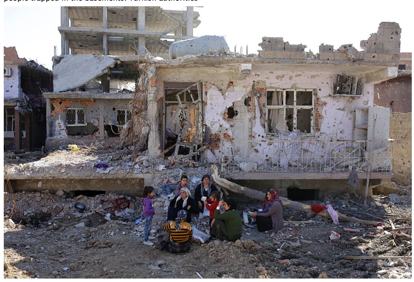
Residents sit in front of their ruined home in Cizre on March 2, 2016, following heavy fighting between government forces and Kurdish fighters.

Turkish security forces and armed opposition groups have both interfered with medical transport units through the use of blockades and checkpoints, failed to provide adequate protection to emergency transport vehicles, and failed to prevent the targeting of emergency response vehicles.