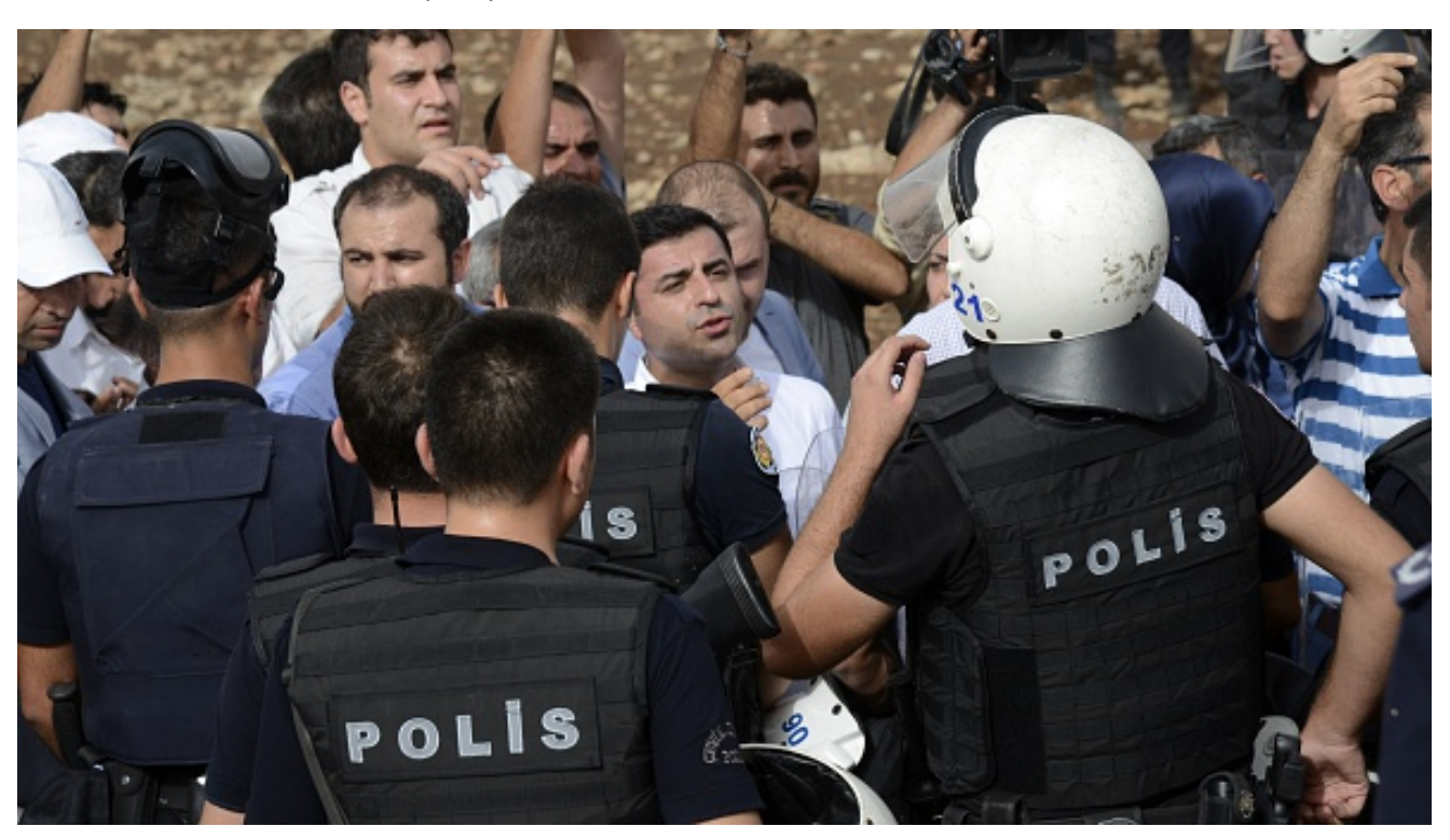
Members of Turkey's pro-Kurdish Peoples' Democratic Party argue with police as they try to enter the Kurdish-dominated city of Cizre, blocked by Turkish security forces, on September 10, 2015.

The implications for people living in Turkey, and particularly those in the southeast, are devastating.