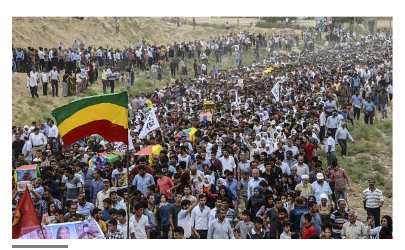
Kurds take part in funerals for people killed during clashes between Turkish forces and Kurdish fighters in Cizre on September 13, 2015, following a week-long curfew imposed to support a military operation against Kurdish fighters.

In 1920, world leaders gathered in France to draw up the Treaty of Sèvres, which divided the territories controlled by the recently dissolved Ottoman Empire. The treaty allowed for the establishment of an independent Kurdistan. Mustafa Kemal Ataturk rejected the agreement, causing the Treaty of Lausanne to replace it by 1923 – this time omitting any mention of a Kurdish homeland. This resulted in the Kurdish population being divided between Iran (8.1 million), Iraq (5.5 million), Syria (1.7 million), and Turkey (14.7 million), and constituting minorities in all states. The Kurds are the largest ethnic minority in the world without a sovereign state.