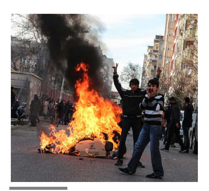
Residents of Diyarbakır protest in March 2016 against curfews imposed on the Sur district of the city.

The blanket curfews have disastrously impacted access to health care services for the affected areas' Kurdish populations, and have facilitated human rights violations by the Turkish authorities. International human rights law states that in times of "public emergency which threaten the life of the nation ... States ... may take measures derogating from their obligations" under the International Covenant on Civil and Political Rights, to which Turkey is state party. But it stipulates that those measures must be strictly proportional to the threat, and may not infringe upon the rights to life, freedom from torture, and equal recognition before the law.3 Further, the curfews constitute collective punishment, a practice strictly prohibited by international humanitarian law, even in times of public emergency and threats to a nation's sovereignty, as collective punishment is a tool used by governments to punish entire communities for suspected dissent or other actions deemed offensive to the state.4 The indefinite curfews imposed by Turkish authorities have failed to meet international standards governing public emergencies, including the conduct of counterterrorism operations.5