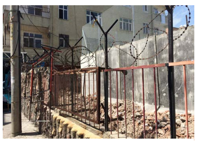
A health care facility in Diyarbakır's Bağlar neighborhood that was being turned into a police station, according to the Health Workers' Union (SES).

International humanitarian law requires parties to a conflict to put in place protective measures to ensure the continued operation of health facilities. The right to health under international human rights law mandates that the state take measures to protect the functioning of health services and ensure they continue delivering health care to the highest attainable standard.<sup>38</sup>