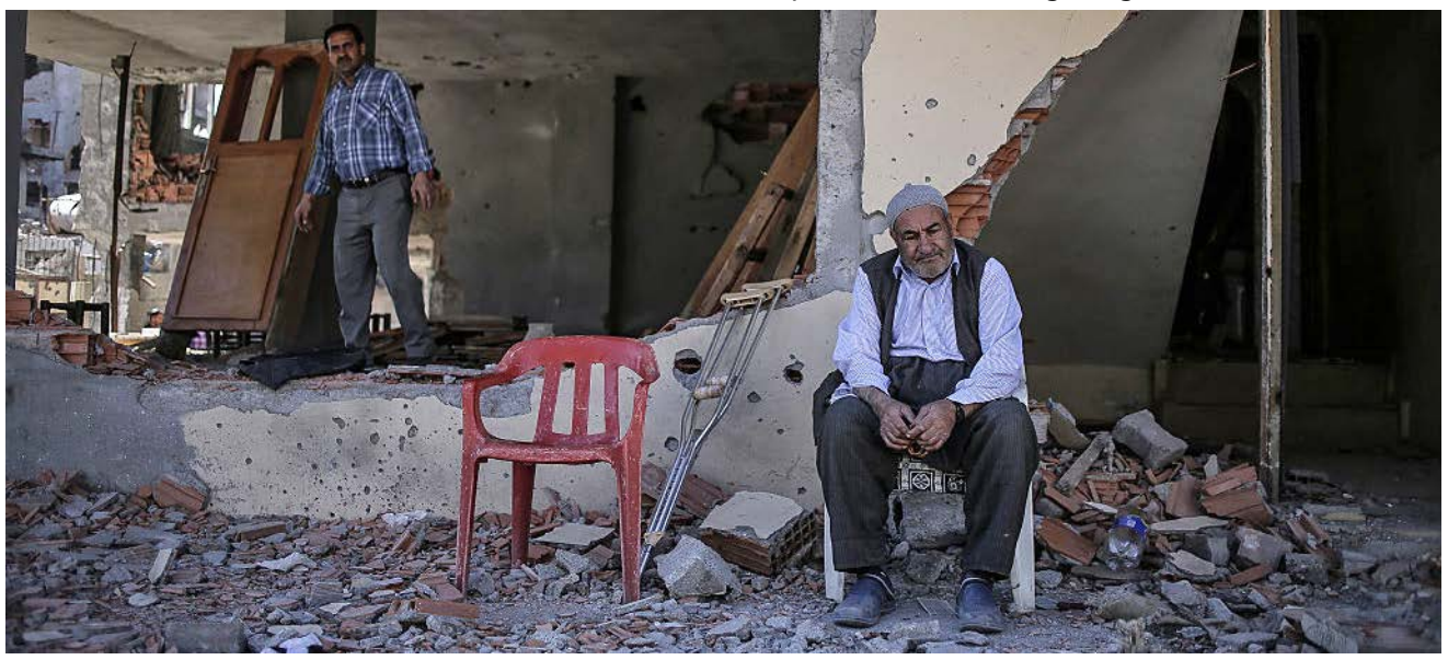
A man sits in front of his home in Cizre, destroyed by fighting between government forces and Kurdish fighters, on March 2, 2016.

Physicians for Human Rights (PHR) calls upon the Turkish government to demonstrate its respect for the rights of all citizens by ceasing unlawful practices that obstruct access to health care and by investigating all allegations of human rights abuses committed since July 2015 in the southeast, including by Turkish security forces. PHR also calls on the Turkish government to respect the rule of law and international human rights standards during the three-month state of emergency imposed on July 21, 2016. Turkey must reinstate compliance with the European Convention of Human Rights - suspended during the state of emergency - cease the blanket arrest and detention of tens of thousands of people without providing due process, and provide protection from torture and other ill-treatment for anyone detained during the government crackdown.