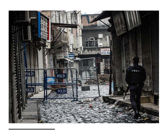
A Turkish police officer patrols a street in the Sur district of Diyarbakır on December 30, 2015 after a curfew was partially lifted.