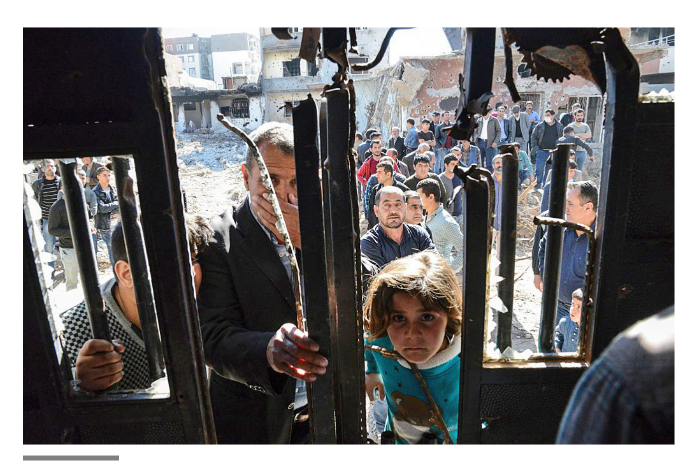
A girl looks at a dead body amid the rubble of damaged buildings on March 2, 2016, following heavy fighting between government troops and Kurdish fighters in Cizre.

Medical workers providing assistance to the wounded and sick are afforded special protections under international humanitarian law. Few of these protections were respected in southeastern Turkey between July 2015 and June 2016. PHR documented indiscriminate attacks on emergency health personnel, indicating that, at the very least, parties to the armed struggle failed to distinguish between a combatant and non-combatant, something they are obligated to do under the laws of war. Various civil society organizations have independently documented assaults on health care workers attempting to provide care to the wounded and sick in neighborhoods under curfew. Whether these deaths constitute extrajudicial or indiscriminate killings, they must be investigated in accordance with Turkey's obligations under international law to protect against violence and ensure justice for human rights violations.