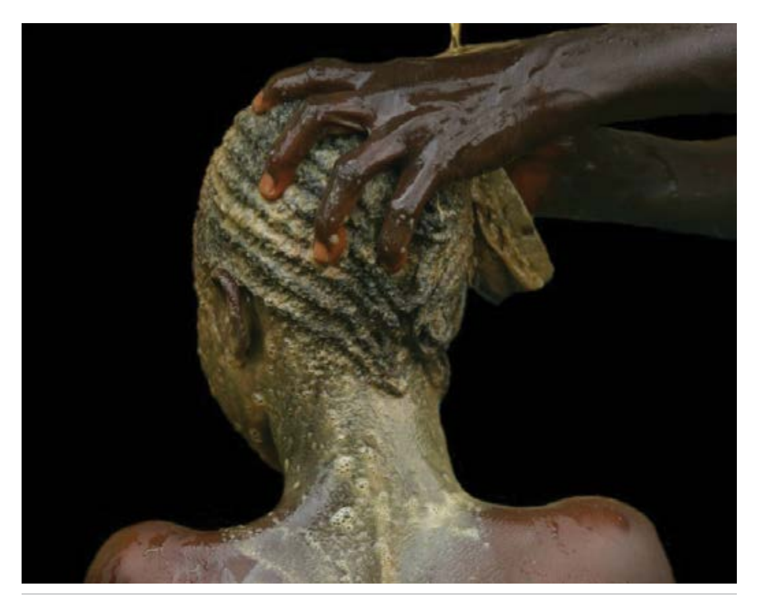
A female former child soldier takes part in a traditional cleansing ceremony before reintegrating back into her community in Sierra Leone.