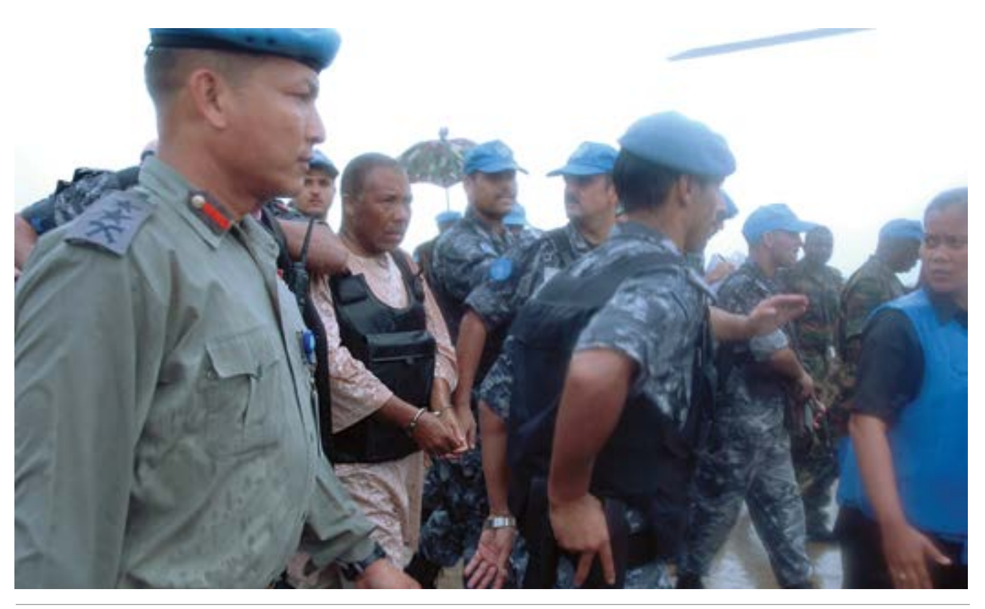
United Nations Mission in Liberia (UNMIL). Peacekeepers arrested former Liberian President Charles Taylor in 2006. Taylor was immediately transferred to the Special Court for Sierra Leone and was subsequently convicted of aiding and abetting the civil war in Sierra Leone. The charges included sexual and gender-based crimes.

Given the diverse and interrelated consequences of conflict for women, justice needs for women survivors have encompassed far more than the need for formal justice or prosecutions. The relationship between gender, development and transitional justice is still an underexplored area of policy development that contains the possibility of furthering comprehensive justice goals and redressing both the causes and consequences of gender-based violations. Women in many societies are subjected to varying forms of gender-based violence in their everyday lives. They are under-represented in the traditionally male-dominated political and socio-economic decision-making structures of their countries, have few or no inheritance rights in practice and may have limited educational or employment opportunities. Each of these factors shapes the impact that conflict has on women.