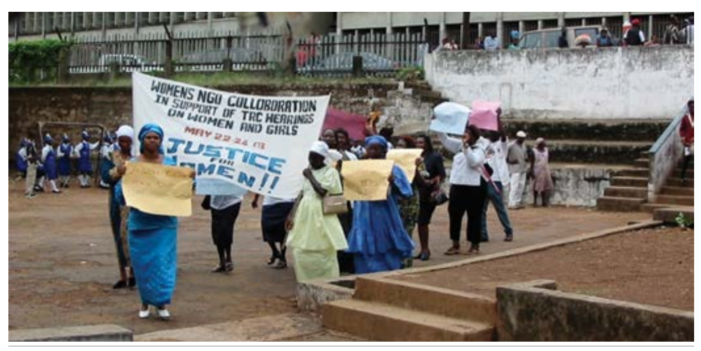
Demonstrators march in support of the TRC's hearings for women and girls in Liberia.

» Ensure that reparations are in proportion to, or linked to, the benefits provided to ex-combatants so that there is no impression that those involved in the violence benefit more than those who bore the brunt of it. In Bosnia and Herzegovina for example, the veterans' pension was revised in 2006 to provide a monthly pension for rape survivors of conflict; in Sierra Leone, the TRC recommended that in establishing pensions recommended for amputees, children and women affected by the conflict—the size of the pensions be determined in relation to ex-combatant pensions and demobilization packages). Community approaches which bring together DDR for ex-combatants, reparations for victims, reintegration efforts for displaced members and community programmes based on participatory development approaches are likely to have the most sustainable impact in reconciliation and peacebuilding.