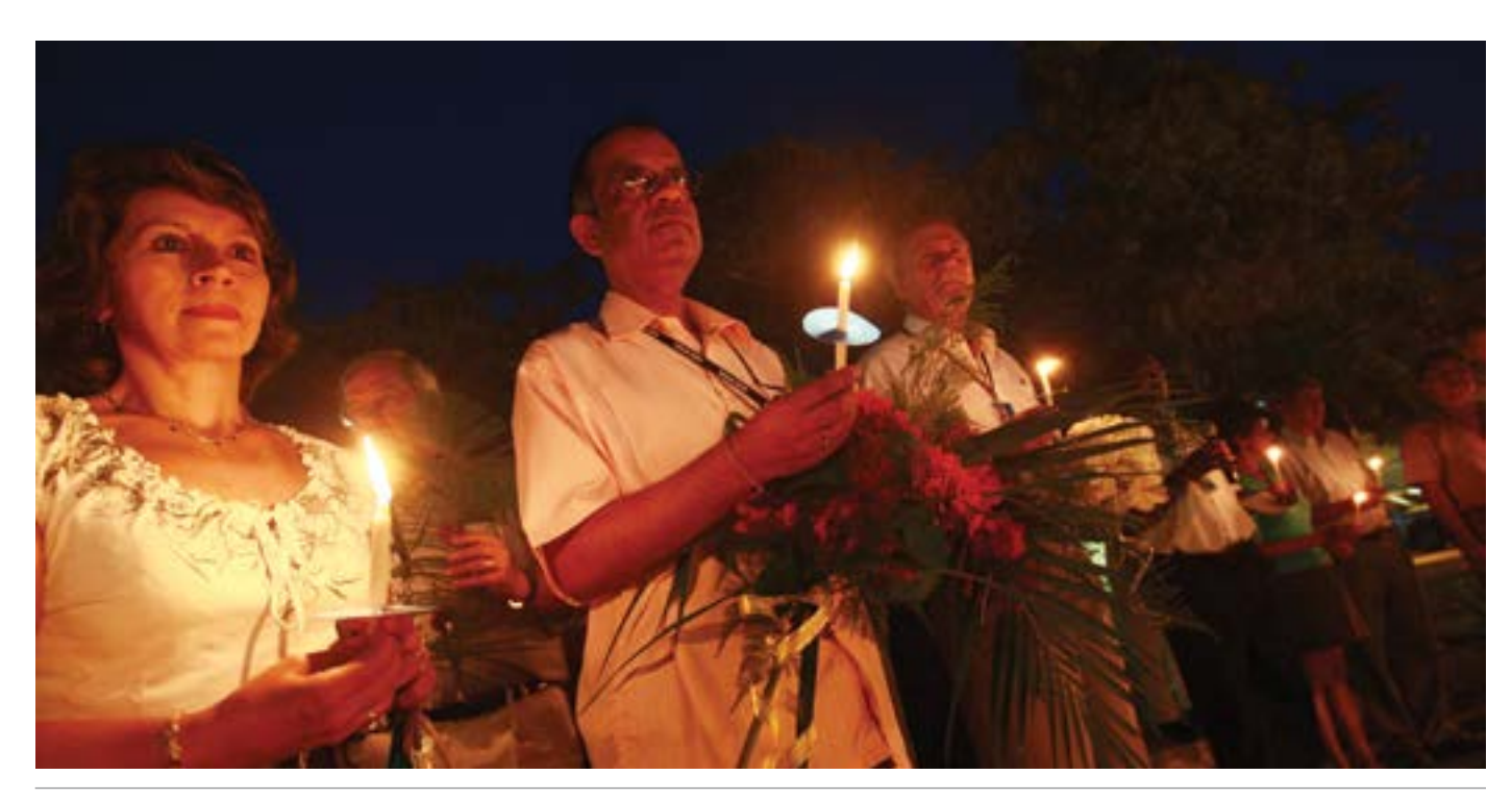
Atul Khare, then-Head of the United Nations Mission in Timor-Leste (UNMIT), accompanied by Finn-Reske Nielsen, former Deputy Special Representative of the Secretary-General for the United Nations Mission in Timor-Leste (UNMIT), attend a memorial ceremony to honour those whose lives were lost during the uprising which followed the announcement of the result of the Popular Consultation on 4 September 1999 in Dili.

social and criminal violence continue to have a disproportionate impact on women, hampering their participation in governance and reconstruction efforts. Gender-sensitive reforms must address barriers to access, whether they be law- or policy-related (e.g., the absence of laws to criminalize domestic violence or rape in marriage) or context-related (e.g., lack of police sensitivity and awareness of their duties regarding violence against women, absence of legal aid, or courts based only in urban areas). Reforms should also include adopting quotas for increasing the number of women in the justice and security sectors. In Liberia, for example, there have been numerous attempts to include women in security sector reforms, including through the establishment of quotas for recruiting women and specialized education initiatives for female recruits. In numerous countries, dedicated units for women and children have been established in police stations to strengthen access to justice. Evidence shows that apart from being simply a just democratic principle, increasing women's representation leads to higher levels of trust in institutions by women, reflected in higher levels of reporting of SGBV crimes.69