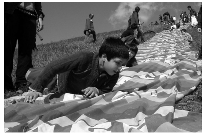
In the rolling hills where the village of Monte Sole once stood before it was destroyed in a Nazi terror raid, the Monte Sole Peace School holds peace education courses for young people from Italy and conflict regions around the world.

For all the diversity of historical experience and culture that memorialization reflects, the dilemmas and choices involved are repeated in country after country. Should memorials be restricted to dignifying and commemorating victims, or should they have a wider function of creating awareness and fortifying democratic institutions? How can they be designed to retain their relevance and compel the attention of new generations? Is it possible to explain the reasons for the success and failure of memorials? What is the relationship between public memorialization and other mechanisms of transitional justice?