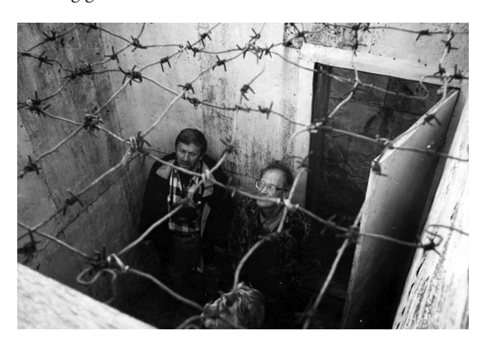
Former prisoners return to Perm-36, where thousands of political prisoners were held from the Stalin era through the late 1980s, now preserved as the Gulag Museum.

Perhaps the success of the Paine memorial owes something to the fact that Paine remains a tight-knit agricultural community (even the landlords who participated in the post-coup repression still live nearby). The historical continuity of communities like Soweto and Paine may favor interaction and dialogue more than the dispersed lifestyle of a metropolis does. Even so, whatever the environment, a key to building community ownership of memory may be to keep its human scale and avoid historical or political abstractions that alienate as well as unite. Ideas and political ideals are notoriously changeable, whereas human qualities remain obstinately immutable. It is this immediately recognizable humanness that enables the viewer to empathize, crossing generational as well as cultural barriers.