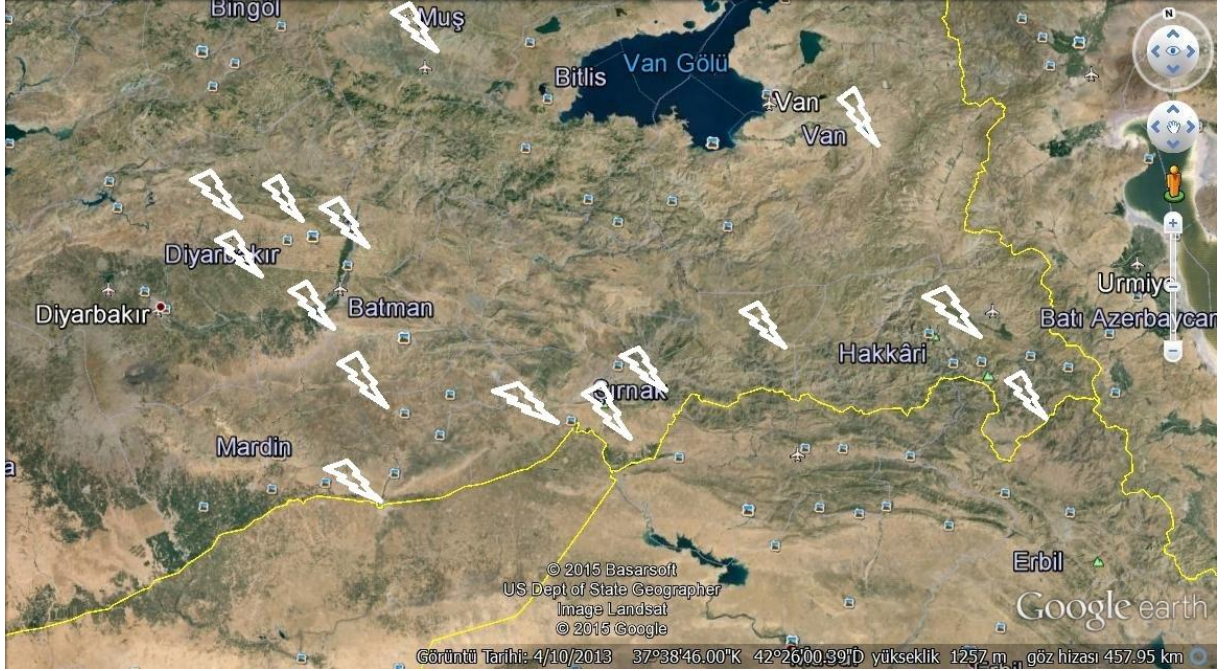
FIGURE No 1: The geographic locations of settlements that have been affected by the clashes in the region. The affected settlements include the districts of Varto, Nusaybin, Dargeçit, Lice, Dicle, Silvan, Sur, Bismil, Beytüşşebap, Silopi, Cizre, Şemdinli, Yüksekova, and İpekyolu.

The GABB (the Union of South-eastern Anatolia Region Municipalities) has pursued three research methods for the field studies: